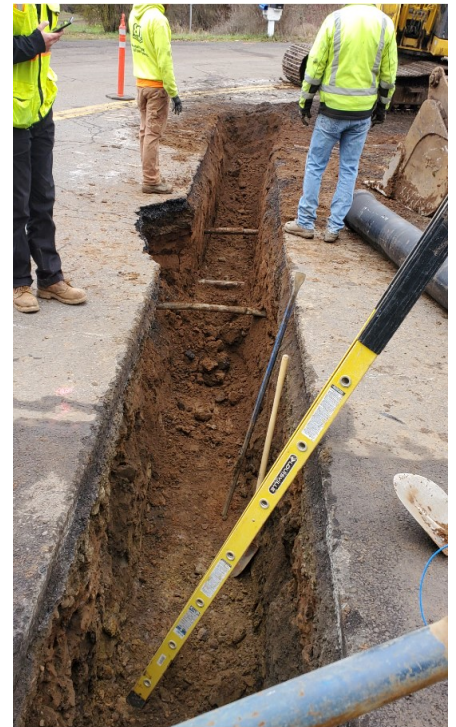
Site cleared for road and reservoir construction.